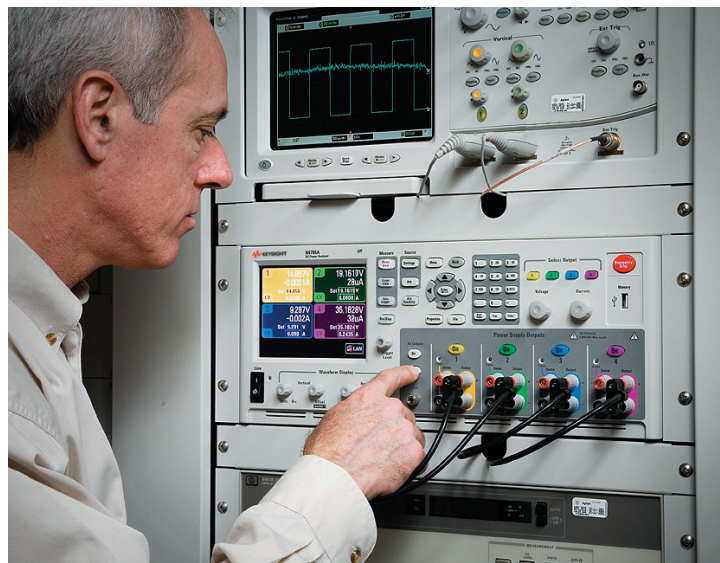
Figure 14. The Keysight N6705 can be installed in a standard 19 inch rack.

The Keysight N6705 has a universal input that operates from 100-240 VAC, 50/60/400 Hz. There are no switches to set or fuses to change when switching from one voltage standard to another. The AC input employs power factor correction.