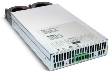
Figure 16. The N6750 high-performance series and N6760 precision series DC power modules that are \geq 300 W each occupy two modules slots within the mainframe. All other modules occupy one module slot.

www.keysight.com/find/N6783A-BAT www.keysight.com/find/N6783A-MFG and download the N6783A-BAT Data Sheet , 5990-8662EN and the N6783A-MFG Data Sheet , 5990-8643EN.