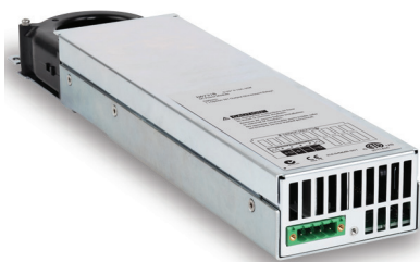
Figure 15. The basic series.

The Keysight N6750 series of high-performance, autoranging DC power modules provide low noise, high accuracy, and output voltage changes that are up to 10 to 50 times faster than other power supplies. Additionally, autoranging output capabilities enable one power supply to do the job of several traditional power supplies.