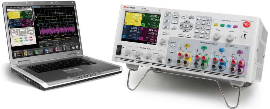
Figure 1. The Keysight N6705 DC power analyzer with 14585A software.

Each DC power module output is fully isolated and floating from ground and from each other.