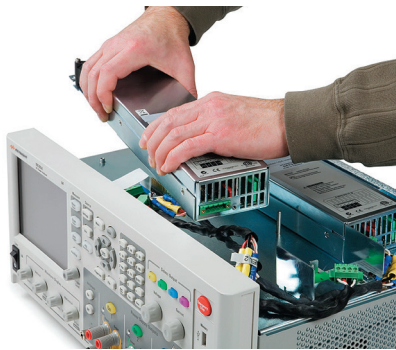
Figure 2. DC power modules are easily installed into the N6705 DC power analyzer mainframe.