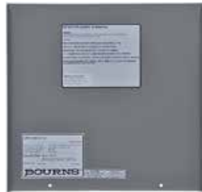
Inside Front Panel