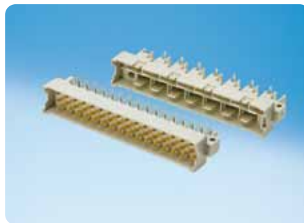
DIN Style F, H & F24/H7