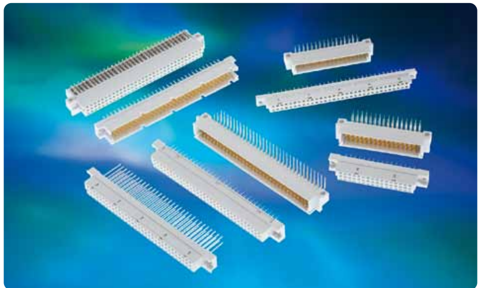
DIN standard and reversed signal