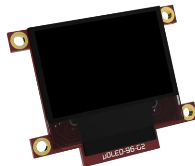
The uOLED-96-G2 Display Module

NOTE (*): Arduino remains the property of the Arduino Team. All references to the word Arduino and Arduino Hardware are licensed under the Creative Commons Attribution Share-Alike license.