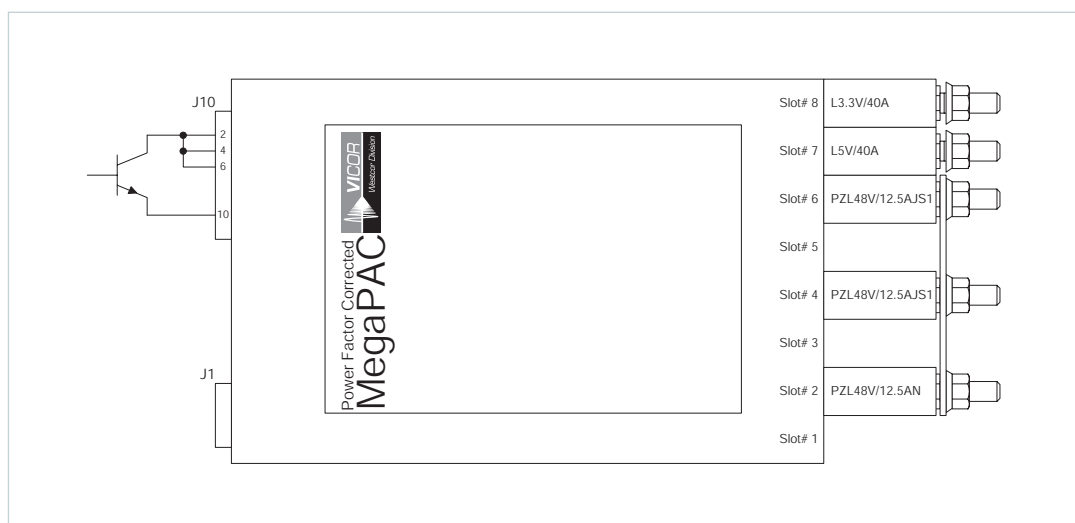
Figure 6 Enable / disable control of Maxi Arrays

Note: For single output power supply configurations, the simplest method of remotely enabling and disabling the output is to use the General Shutdown (GSD) function.