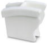
Switching lock, plug-in