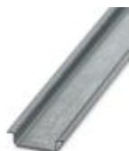
DIN rail, material: Galvanized, unperforated, height 7.5 mm, width 35 mm, length: 2 m

DIN rail - NS 35/ 7,5 ZN UNPERF 2000MM - 1206434