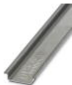
DIN rail, unperforated, Width: 35 mm, Height: 7.5 mm, Length: 2000 mm, Color: silver

DIN rail, unperforated - NS 35/ 7,5 AL UNPERF 2000MM - 0801704