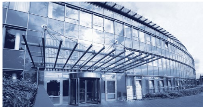
Basler AG Germany, Headquarters

Basler has 30 years of experience in computer vision. The company is home to approximately 500 employees at its headquarters in Ahrensburg, Germany, and its subsidiaries and sales offices in Europe, Asia, and North America.