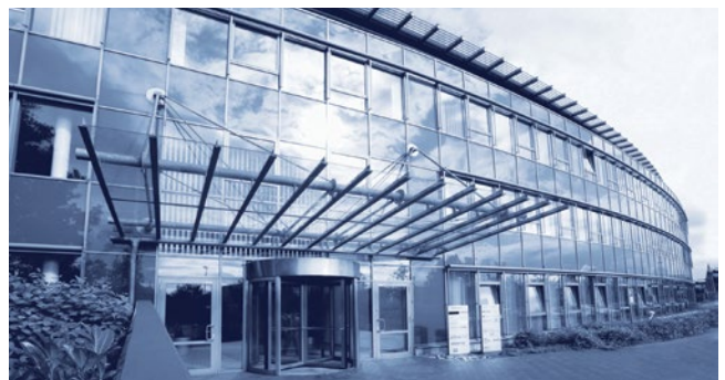
Basler AG Germany, Headquarters

Basler has 30 years of experience in computer vision. The company is home to approximately 500 employees at its headquarters in Ahrensburg, Germany, and its subsidiaries and sales offices in Europe, Asia, and North America.