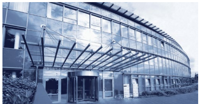
Basler AG Germany, Headquarters

Basler has 30 years of experience in computer vision. The company is home to approximately 500 employees at its headquarters in Ahrensburg, Germany, and its subsidiaries and sales offices in Europe, Asia, and North America.