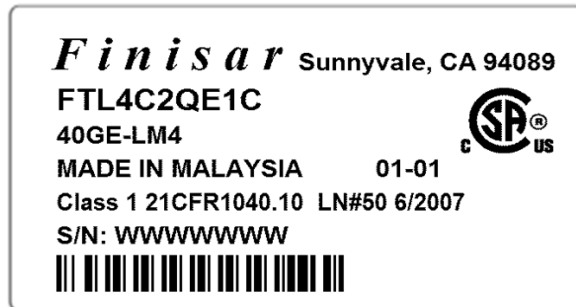
Figure 3 – FTL4C2QE1C label