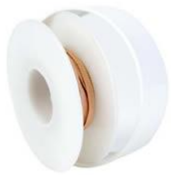
1805-5F Pro Wick Brown #5 Braid 5' 25 units/case