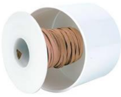
1803-25F Pro Wick Green #3 Braid 25' 1 units/case