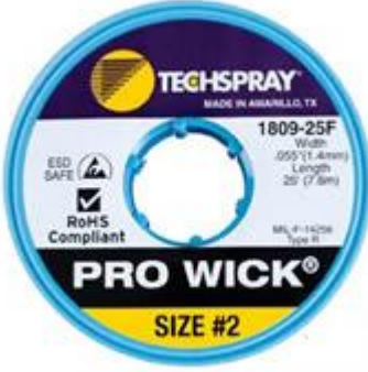
1810-25F Pro Wick Green #3 Braid - AS 25' 1 units/case