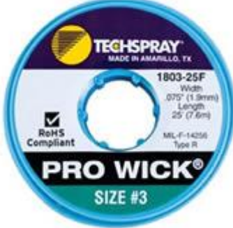
1804-5F Pro Wick Blue #4 Braid 5' 25 units/case