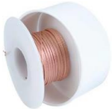
1806-100F Pro Wick Red #6 Braid 100' 1 units/case