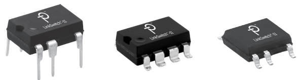
Figure 2. Package Options.