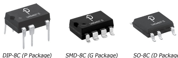
Figure 2. Package Options.