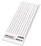
Marker cards, Card, white, Unlabeled, Can be labeled with: Plotter, Mounting type: Snap into tall marker groove, Snap into flat marker groove, For terminal block width: 6.2 mm, Lettering field: 6 x 6.1 mm

Marker cards - SBS 6:UNBEDRUCKT - 1007222