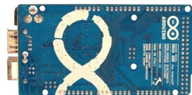
Arduino ADK Back