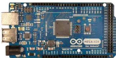
Arduino ADK Front