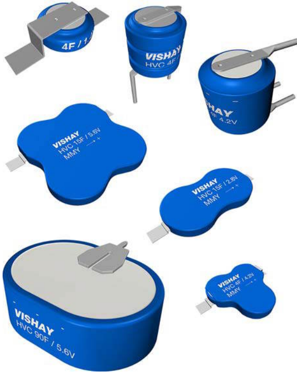
Image is not to scale