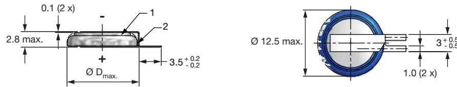
Fig. 6 - Form D2: Surface Mount Flat (single cell, keyed polarity)