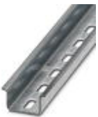
DIN rail, material: Galvanized, perforated, height 15 mm, width 35 mm, length: 2 m

DIN rail - NS 35/15 ZN PERF 2000MM - 1206599