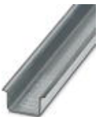
DIN rail, material: Galvanized, unperforated, height 15 mm, width 35 mm, length: 2 m

DIN rail - NS 35/15 ZN UNPERF 2000MM - 1206586