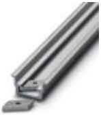
DIN rail, deep drawn, high profile, unperforated, 1.5 mm thick, material: aluminum, height 15 mm, width 35 mm, length 2000 mm

DIN rail, unperforated - NS 35/15 AL UNPERF 2000MM - 1201756