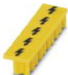
Warning cover, 5-pos., for terminal width: 5.2 mm

Zack Marker strip, flat - ZBF 5 CUS - 0825025