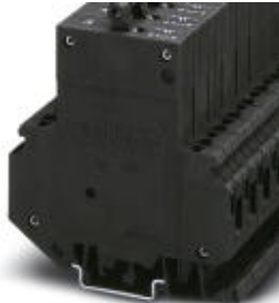
Thermomagnetic circuit breaker, 1-pos., normal blow, 1 N/O contact, with universal foot for mounting on NS 32 or NS 35

Please be informed that the data shown in this PDF Document is generated from our Online Catalog. Please find the complete data in the user's documentation. Our General Terms of Use for Downloads are valid ( http://download.phoenixcontact.com )