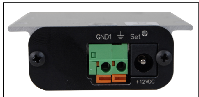
Figure 2. Rear view of Wrist Strap and Ground Monitor

Attach 18 AWG wires to the unit as described below. Strip back the vinyl insulation at each end of the wires to approximately 1/3 inch (8 mm). Twist the stranded wire on each end before inserting the wire into each connector location. In order to attach the wire, insert a small blade screwdriver into the orange slot above. Gently push inward and insert the stripped wire fully into the hole in the green connector. Hold the wire fully in and release the screwdriver to allow the wire to catch. Attach the green monitor ground cord to the ground connector on back of unit. Attach the impedance monitor wire to the “GND1” connector on the back of the unit.