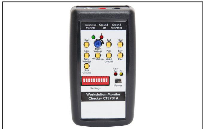
Figure 3. SCS CTE701 Workstation Monitor Checker

The checker verifies the proper operation of dual wrist strap monitoring. Connect a 3.5 mm test cable to both the checker and to the operator jack of the monitor. At this point the monitor should indicate failure. Depress the Pass button on the wrist strap section. The monitor should indicate a good connection. While pressing the Pass button, press body voltage “high.” At this point the Wrist Strap LED would be blinking red.