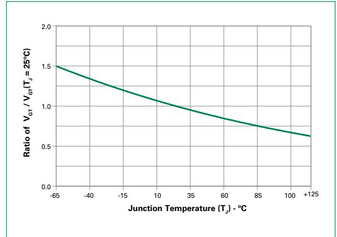
Figure 4: Normalized DC Gate Trigger Voltage for All Quadrants vs. Junction Temperature