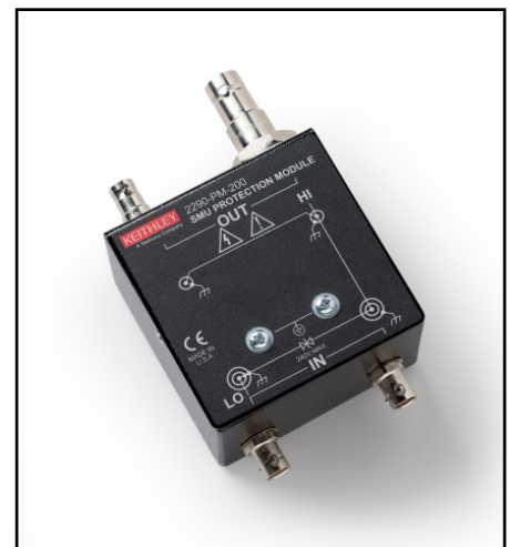
The Model 2290-PM-200 Protection Module protects low voltage measurement equipment from voltages greater than 200V.

When low voltage measurement instrumentation is used in the high voltage circuit, the protection module safely clamps the voltage across the instrument to a maximum value of 200V even when a device under test (DUT) breaks down. Thus, a Series 2290 Power Supply, Model 2290-PM-200 Protection Module, and Keithley accessories provide all the elements for building a safe, high voltage test environment.