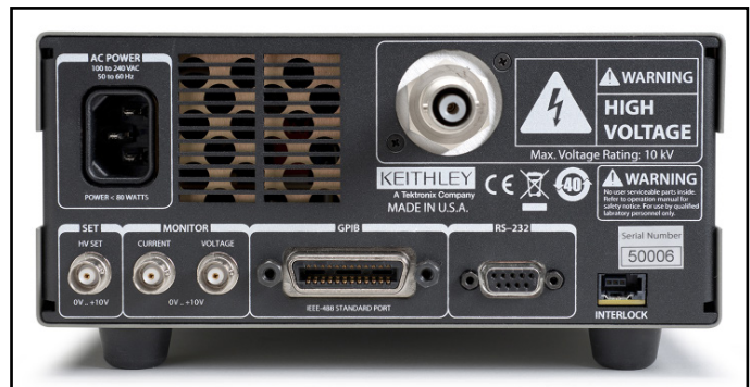
Model 2290-10 rear panel showing the IEEE-488 interface connector, RS-232 interface connector, high voltage output connector, analog control/output connectors, and interlock connector.