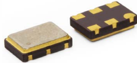
Part Dimensions: 7.0 × 5.0 × 2.0mm • 178.462mg