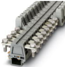
Universal terminal block with bolt connection, cross section: 6 - 25 mm 2 , AWG: 10 - 4, width: 26 mm, color: Gray

Please be informed that the data shown in this PDF Document is generated from our Online Catalog. Please find the complete data in the user's documentation. Our General Terms of Use for Downloads are valid ( http://download.phoenixcontact.com )