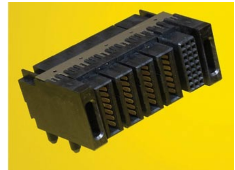
Vertical Socket Assembly (Series 75541)