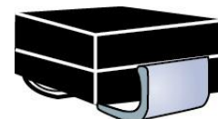
DO-214AB (SMCJ) Package

NOTE: All SMC series are equivalent to prior SMM package identifications.