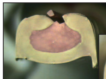
Visible Deformation of Outer Crimp Surface as a result of Indentation from Material Buildup on Crimper