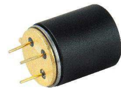
Isolating Cover Option

Examples; 805M1-0020 Model 805M1, 20g range