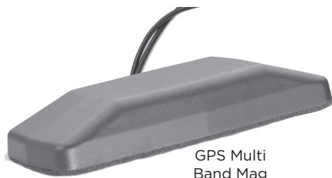
GPS Multi Band Mag Mount