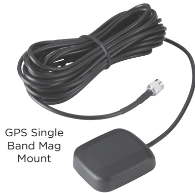
GPS Single Band Mag Mount