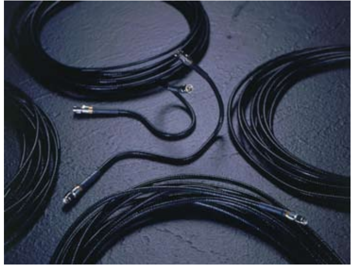
GORE™ RF Jumper Assemblies are available in a variety of lengths

The small bend radius makes these assemblies easier to route in tight spaces and a cable bend radius as small as 0.40 in (10.2 mm) is achieved with no degradation in electrical performance.