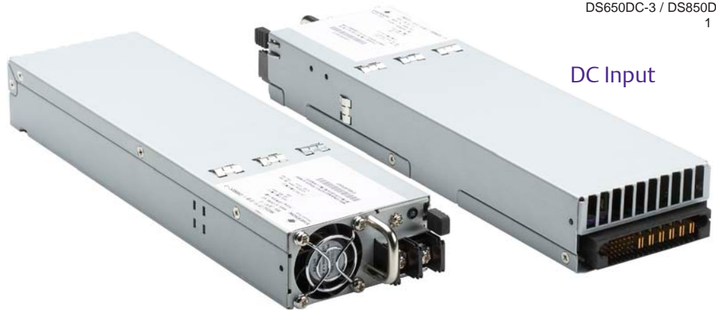
Connector input shown

Distributed Power Bulk Front-End Total Output Power: 650 - 850 Watts +3.3Vdc Stand-by Output Standard Telco input range -39 V to -72 VDC