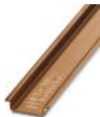
DIN rail, material: Copper, unperforated, height 7.5 mm, width 35 mm, length: 2 m

DIN rail - NS 35/ 7,5 CU UNPERF 2000MM - 0801762