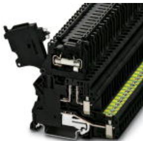
Lever-type fuse terminal block, black, for 5 x 20 mm G fuse inserts, with LED for 60 V DC

Please be informed that the data shown in this PDF Document is generated from our Online Catalog. Please find the complete data in the user's documentation. Our General Terms of Use for Downloads are valid ( http://download.phoenixcontact.com )