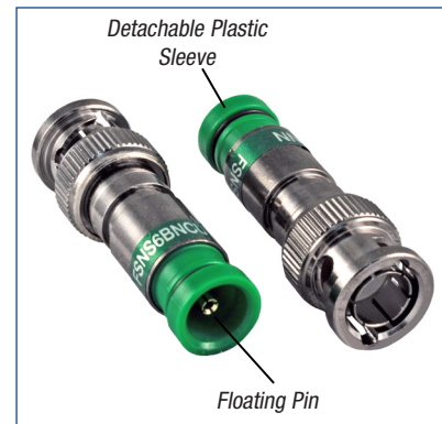
FSNS6BNCU ProSNS™ Universal BNC Series 6 Connector

Like our 59 and 6 connectors, the ProSNS™ RG-11 F connectors utilize a plastic pin guide for greater connector performance and easy installation.