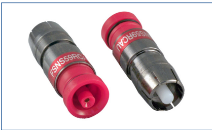
FSNS59RCAU ProSNS™ Universal RCA Connector