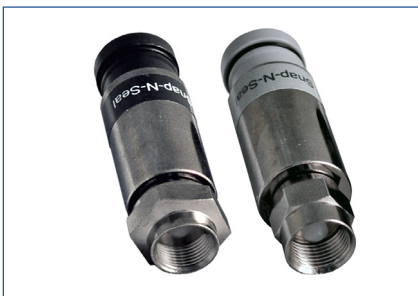
SNS1P11H and 716SNS1P11HPLA ProSNS™ Universal RG-11 Connectors