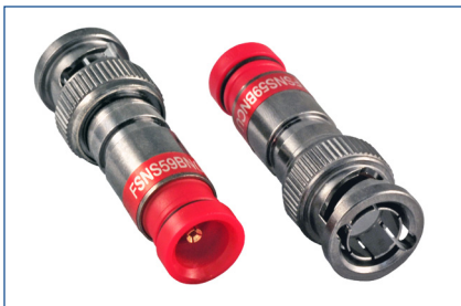
FSNS59BNCU ProSNS™ Universal BNC Connector