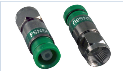
FSNS6U ProSNS™ Universal F Connector

Installations in Commercial and Residential Audio/Video, Security, and Broadband markets will be a "snap", thanks to the low compression force associated with traditional Snap-N-Seal® connectors along with the patented non-blind entry with a floating pin design from F-Conn®.