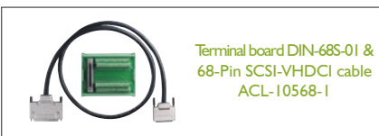
Terminal board DIN-68S-01 & 68-Pin SCSI-VHDCI cable ACL-10568-I