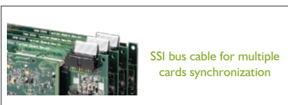
SSI bus cable for multiple cards synchronization

32-CH 16-Bit 500 kS/s Multi-Function DAQ Card with Encoder Input