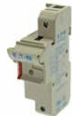
CH modular fuse holder with neon indicator for 22x58 mm fuse