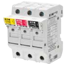
CH modular fuse holder for 10x38 mm fuses - PV (yellow), IEC 10x38 and UL midget (red), and UL Class CC (black)