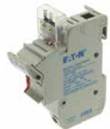
CH modular fuse holder with microswitch for 14x51 mm fuse