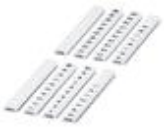
Zack Marker strip, flat, Strip, white, Unlabeled, Can be labeled with: Plotter, Mounting type: Snap into flat marker groove, For terminal block width: 5 mm, Lettering field: 5.1 x 5.2 mm

Zack Marker strip, flat - ZBF 5:UNBEDRUCKT - 0808642