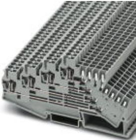
Multi-level terminal block, Connection method: Spring-cage/plug-in connection, Cross section: 0.08 mm 2 - 4 mm 2 , AWG: 28 - 12, Width: 5.2 mm, Color: gray, Mounting type: NS 35/7,5, NS 35/15

Please be informed that the data shown in this PDF Document is generated from our Online Catalog. Please find the complete data in the user's documentation. Our General Terms of Use for Downloads are valid ( http://download.phoenixcontact.com )