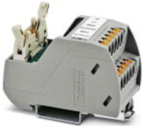
VARIOFACE Professional (VIP) board for the ROC800 controller

Please be informed that the data shown in this PDF Document is generated from our Online Catalog. Please find the complete data in the user's documentation. Our General Terms of Use for Downloads are valid ( http://phoenixcontact.com/download )