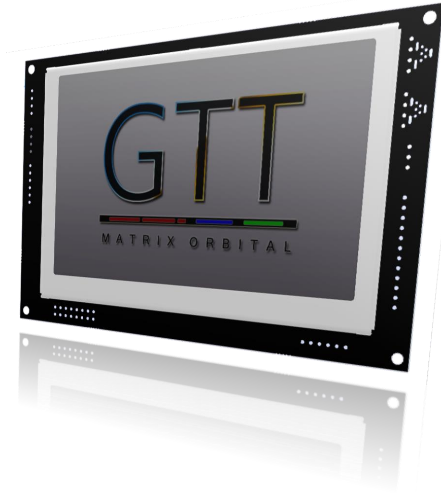
Figure 1: The GTT50A Display