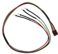
Figure 4: BBC

For a more flexible interface to the GTT, especially with the I 2 C protocol, a Breadboard Cable may be used. This provides a simple four wire connection that is popular among developers for its ease of use in a breadboard environment.