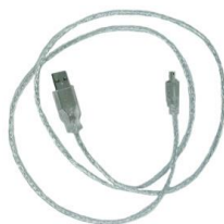
Figure 5: EXTMUSB3FT

The External Mini-B USB Cable is recommended for USB communication. It will connect to the Mini-B style header on the unit and provide a connection to a regular A style USB connector, commonly found on a PC.