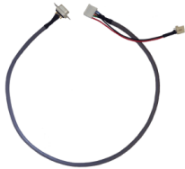
Figure 3: ESCCPC5V

The most common cable choice for the any GTT display, the Extended Communication/ Power Cable offers a simple connection to the unit with familiar interfaces. A DB9 and floppy power header provide all necessary input to communicate to and power your display.