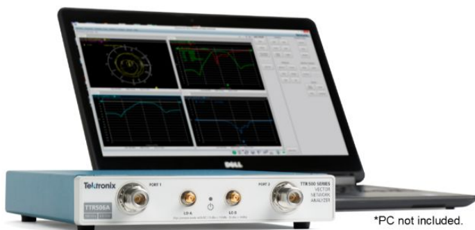
*PC not included.

An independent RF source and three RF receivers for each port of the TTR500 enable you to take high-accuracy magnitude and phase measurements with a 1-port or 2-port device under test (DUT). Use the TTR500 to perform complete S_{11} , S_{12} , S_{21} , and S_{22} measurements of the DUT and display data in a variety of formats (see measurement functionality table).