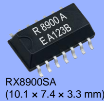
RX8900SA (10.1 × 7.4 × 3.3 mm)

Product Number (Please contact us) RX8900SA : X1B000292xxx00 RX8900CE UA : X1B000301000100 RX8900CE UB : X1B000301000200 RX8900CE UC : X1B000301000300