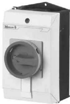
for wall installation