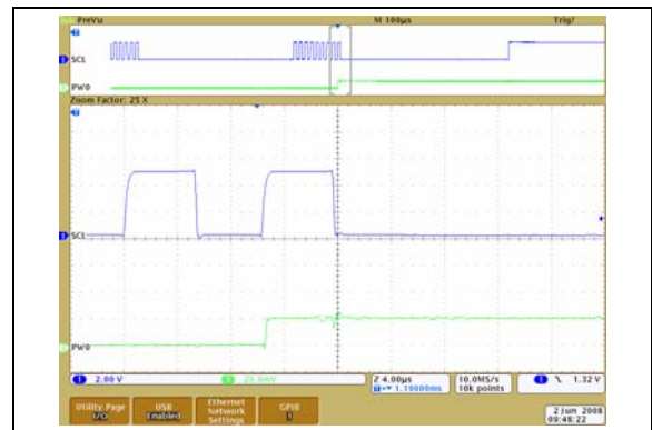
FIGURE 2-48: 100 k \Omega – Low-Voltage Increment Wiper Settling Time ( V_{DD} = 2.7\text{V} ) ( 1\ \mu\text{s}/\text{Div} ).