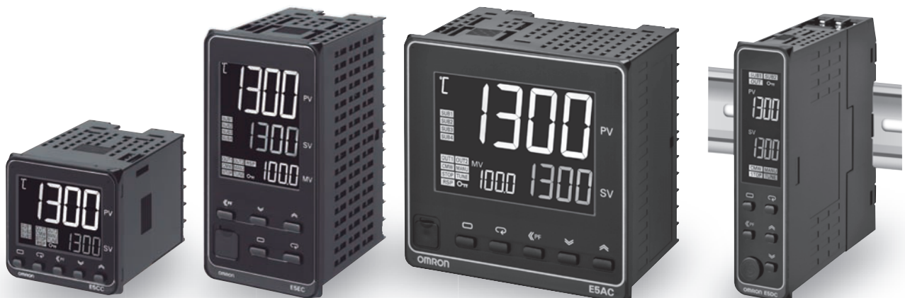
48 × 48 mm E5CC

New Models That Mount to DIN Track and Are Ideal for HMI/PLC Connections.