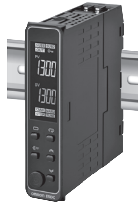
22.5 mm Wide, and DIN Track-mounting Type E5DC

Refer to your OMRON website for the most recent information on applicable safety standards.