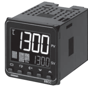
48 × 48 mm E5CC

Refer to your OMRON website for the most recent information on applicable safety standards.