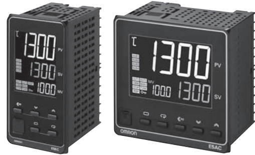
48 × 96 mm E5EC