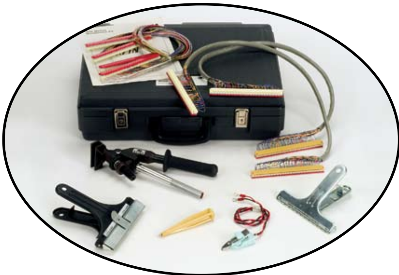
The 3M™ MS™ Module Maintenance Kit 4026-A contains the tools necessary for re-entry of super-mini and super-mate modules. The kit may be used for splice module combinations of two- through seven-way stackable splices.