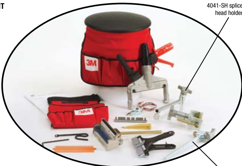
The 3M™ MS™ Splicing Rig 4049/NXG is a lightweight and portable splicing rig.